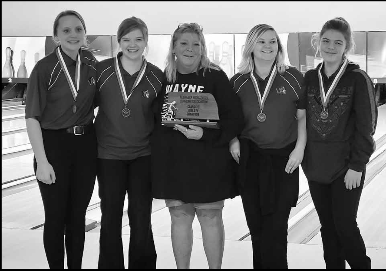
Girls Junior Varsity Team