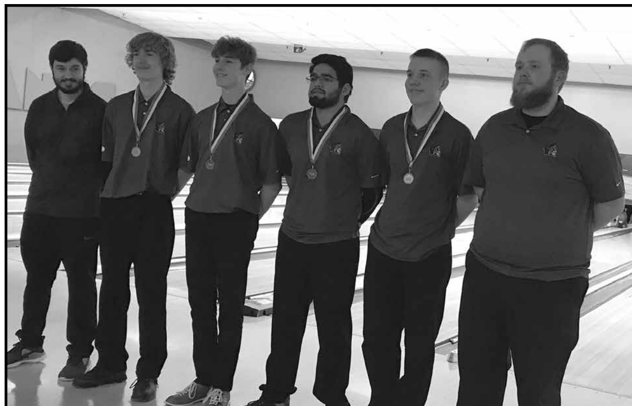
Boys Varsity Team

Wayne Teams from State Bowling Competition Junior Varsity Boys and Girls Won State Varsity Girls Won State Varsity Boys were Runner-Up