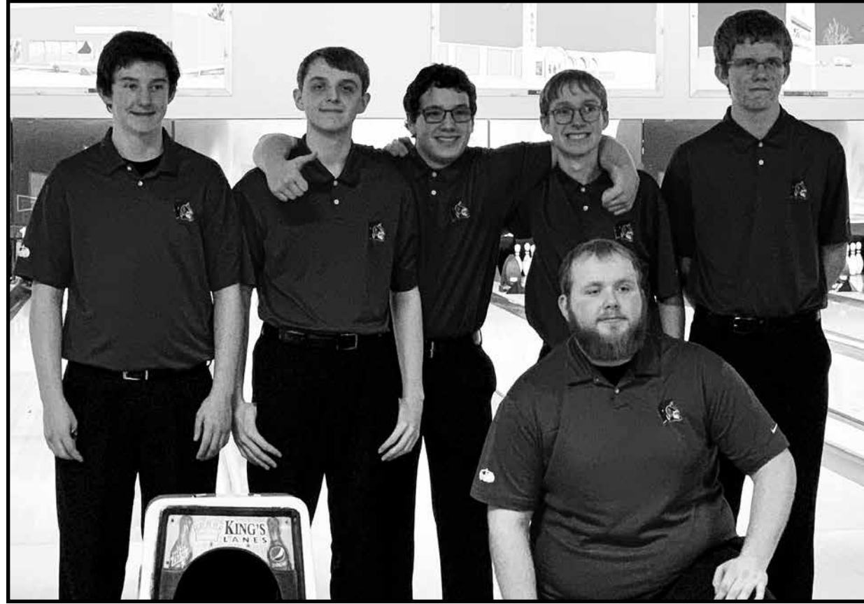
Boys Junior Varsity Team